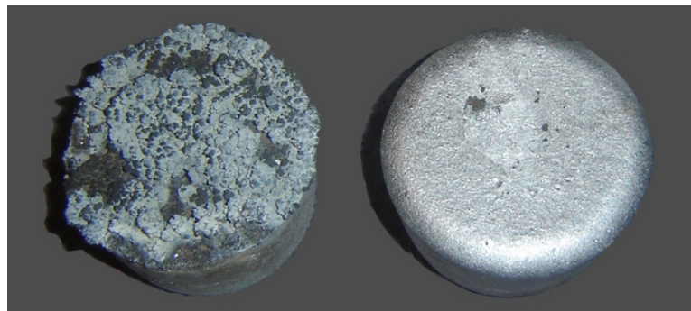
Figure 4: Comparison of oxidation of AZ91D (left) and AM-lite ® (right) solidified in air.

The oxidation behaviour of AM-lite ® in the molten state and during solidification is responsible for many of the alloy's surface properties. For example, during diecasting, the surface film on a liquid metal influences its flow characteristics and in particular the ability for opposing flows to bond metallurgically during filling of the cavity. The high resistance to oxidation of AM-lite ® enables such opposing flows to bond effectively during solidification contributing to a much lower defect density in these regions. It also allows molten metal to flow smoothly under pressure to fill small interstices created through shrinkage and, in particular, contributes to the smooth shiny as-cast surface of AM-lite ® die castings whose oxidation resistance persists after casting.