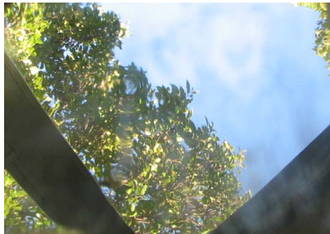
Figure 1: Reflected image in the as-cast surface of an AM-lite ® diecasting produced under conditions that provide a mirror finish.

The excellent diecastability of AM-lite ® stretches to an ability to produce an as-cast mirror surface finish. Production of such a finish requires a polished die surface, minimization of the amount of die lubricant used and appropriate adjustment of diecasting parameters. An example of a mirror as-cast surface is shown in Fig. 1. As-cast surfaces such as this provide considerable advantages in surface finishing.