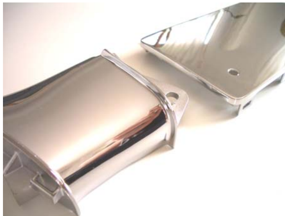
Figure 5: Diecast AM-lite ® automobile parts electroplated using the Bondal ® Mg process.

The Bondal ® Mg pretreatment process for AM-lite ® allows the full range of possibilities for deposition of decorative electroplated layers and top coats that are available to other materials. Electroplated AM-lite ® displays excellent coating performance in standard testing regimes. For example, no chipping or adhesion loss is experienced in standard saw cut tests. Accelerated CASS corrosion tests in accordance with ASTM and DIN standards have shown the absence of corrosion for up to 72 hours which is equivalent to more than 500 hours in standard neutral salt spray testing.